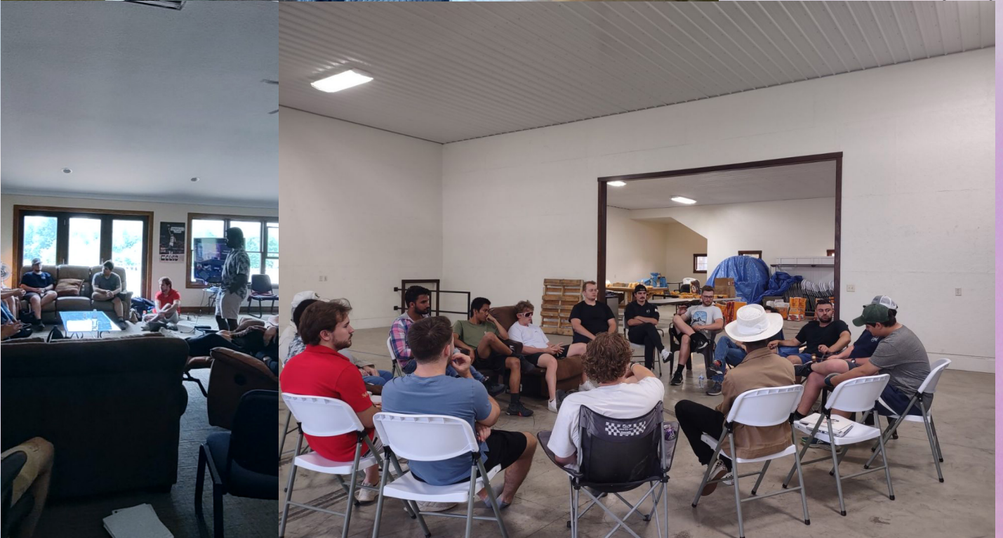
Ending the day