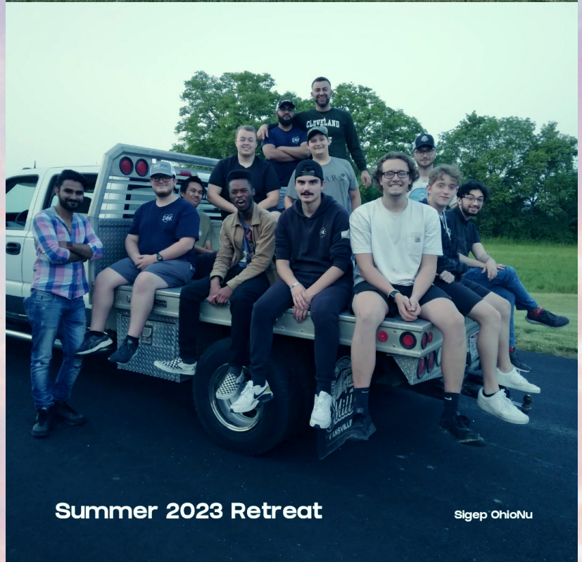
Summer 2023 Retreat