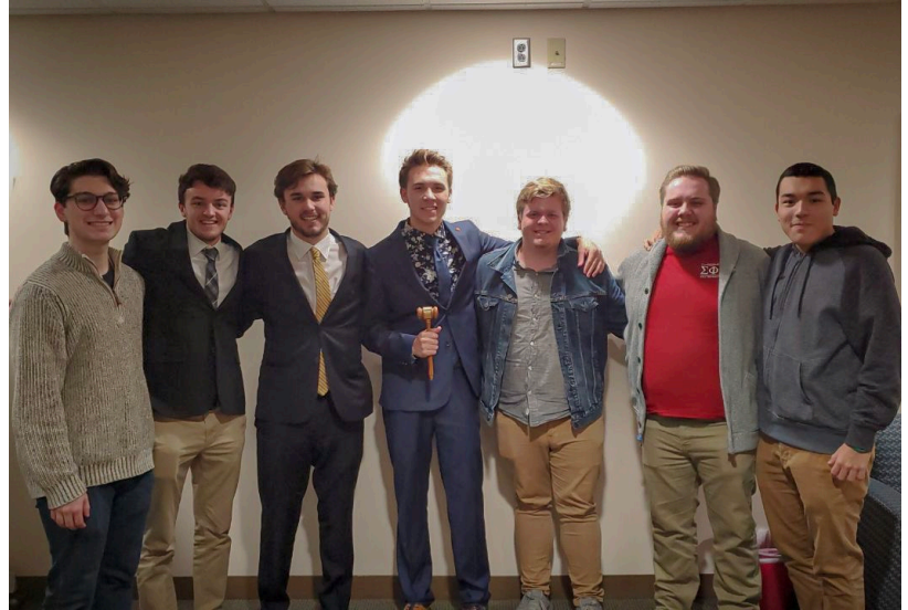
Ohio Nu 2020 Exec Board

For the upcoming semester, the fine men of Sigma Phi Epsilon want to continue the work we have already done with campus involvement. We will continue this work by getting more of our new members involved with the numerous groups we have already established leadership roles in. We are spearheading positive changes here at Cleveland State University. This way, everyone in fraternities and sororities can grow together.